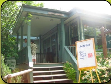
The Conference room for our use