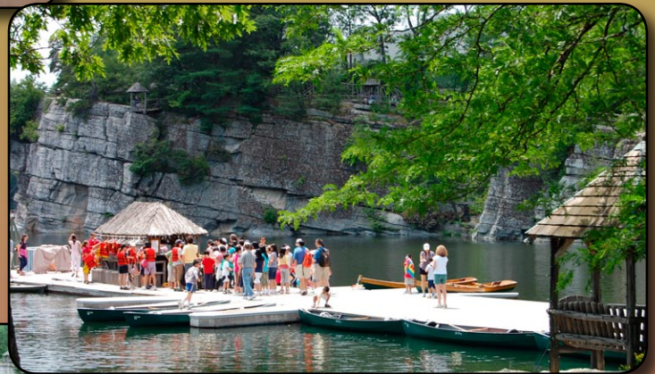
A very crowded boat dock