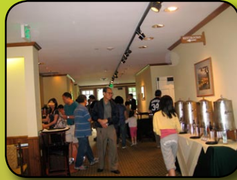
Inside the Conference room, with breakfast and all