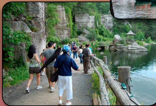
Hiking path to the top